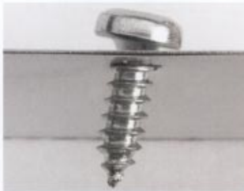
Standard type AB screws lean over as the screw tends to align with the helix angle of the thread. Stripped threads or loose assemblies result.

The net result of all of the above features is the best performing fastener for thin metal assemblies that has ever been offered in the TRILOBULAR™ products portfolio. Feel free to learn more about FASTITE® 2000™ screws and download a FASTITE® 2000™ fastener brochure at our web site www.taptite.com .