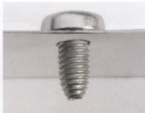
FASTITE® 2000™ fasteners start straight and finish straight, providing a secure tight assembly. The twin-lead thread centers the fastener in the hole.